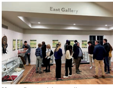
History Center exhibition gallery