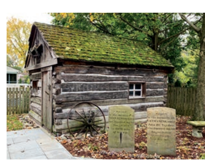
Log Cabin with headstones, c. 1840