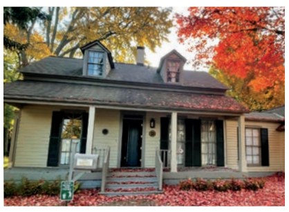
Provencal-Weir House, c. 1823

GPHS collections include maps, blueprints, documents, bills, contracts, letters, books, catalogs, photographs, videos, prints, drawings watercolors, scrapbooks, oral histories, albums, real estate records and additional ephemera relating to the history of the Grosse Pointes and neighboring communities as well as objects, tools, household goods and furniture.