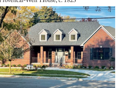
Grosse Pointe History Center, 2022