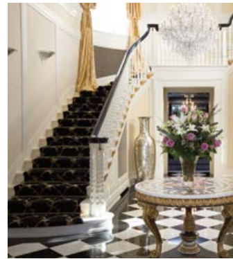
Some Enchanted Evening, 2015