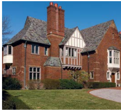
By the Light of the Silvery Moon, 2012