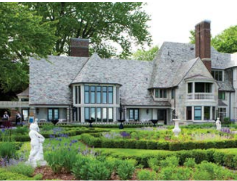
Lilac Time, 2011

On Friday, June 16, the Grosse Pointe Historical Society will hold its 14th annual Summer Fundraiser Gala. This year's event, Summer on the Lake , will be held at a Coastal-Craftsman style home on Lake Shore Road in Grosse Pointe Shores. The expansive, relaxed, and elegant home, with extensive park-like grounds, will have guests feeling they've been transported to a private estate in the Hamptons!