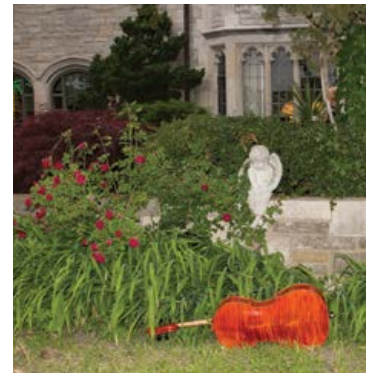
Moonlight at the Manor, 2016