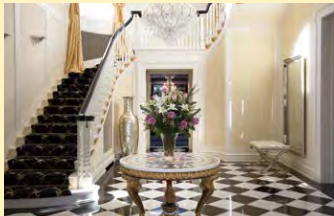
Some Enchanted Evening, 2015