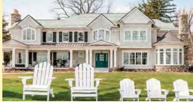
Summer on the Lake, 2017