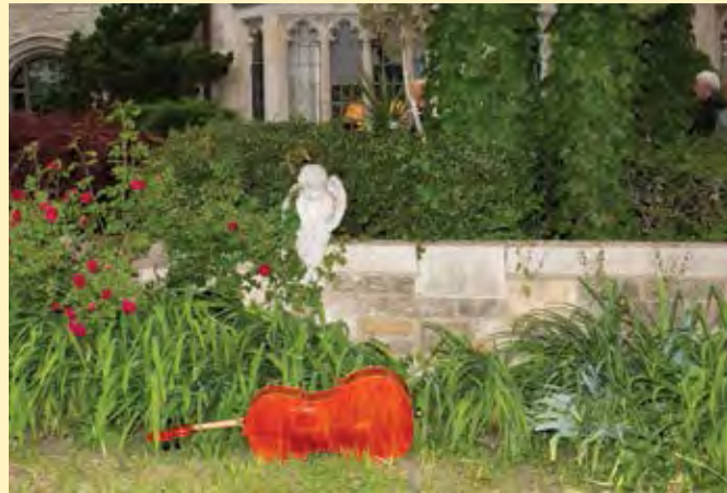
Moonlight at the Manor, 2016