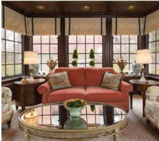
Unique woodwork abounds throughout the home. ➤

Brocaded walls, crystal and marble furnish the lavish dining room.