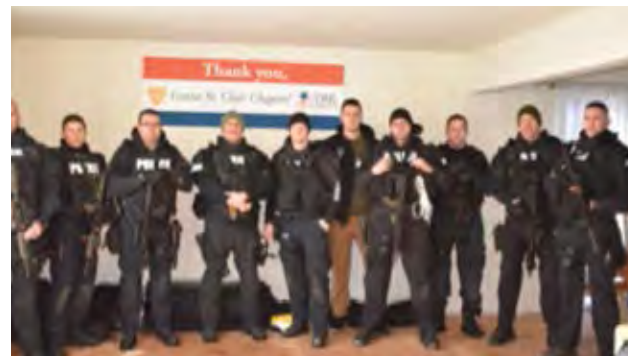
The Special Response Team