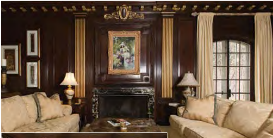
The sunken living room features paneling with gilded details.

Order tickets now 313-884-7010 or www.gphistorical.org