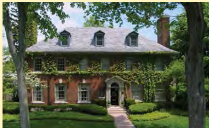
English Elegance, 2014