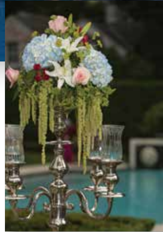
A floral arrangement inspired by the home and created by Flowers for Any Event.