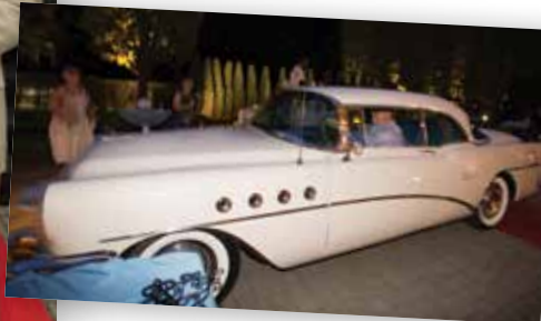
1955 Buick – 2 Door Riviera