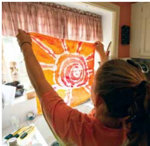
Julia proudly holds her completed batik napkin. Batik is a technique using hot wax and dye. Designs are drawn on the fabric with hot wax, and then dye is applied. The wax is a barrier to the color. Once the fabric is dry, the wax is removed by rinsing it in hot water and then drying it.

The first session this summer focused on gardens. The children decorated glass votives and a flower vase, and adorned a terra cotta flowerpot with glass beads and tile glue. They also created original designs on cotton napkins using clear glue and acrylic paint. To complete the garden-themed table setting, the children decorated coasters using cotton jumping