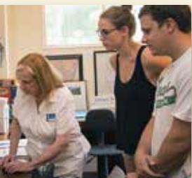
Researchers were available during the party to show some of the reference materials available in the Alfred S. and Ruth M. Moran Resource Center.