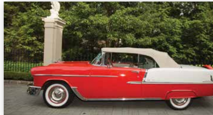
The Harley Earl 1955 Chevrolet Bel Air Coupe.