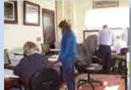
Research assistants are busy at work in the Alfred B. and Ruth S. Moran Resource Center.

Continued from cover information is also available from the Society's photograph collection, original documents and organization partners.