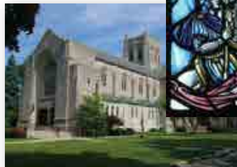
Grosse Pointe Memorial Church