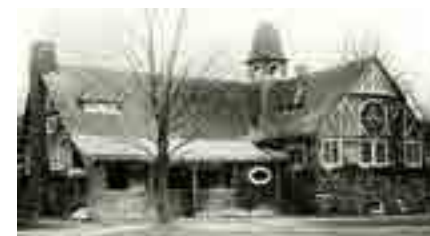
The first Grosse Pointe Memorial Church.