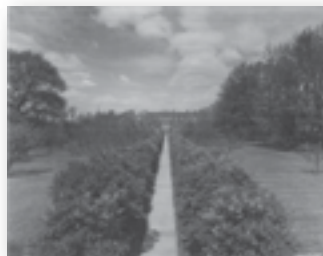
Cottage Hospital as a Nurses' Residence in 1928.

The beautiful three-story residence was built the same year that Cottage Hospital (now Henry Ford Medical Center – Cottage) opened its building. Architect Raymond