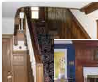
38 McKinley Place features Craftsman interiors.

The individuals and organizations that have used their imagination and creativity to preserve – and even repurpose – these buildings will be recognized for their vision at a free program on Tuesday, May 12 at 7:30 p.m. at the Grosse Pointe War Memorial.