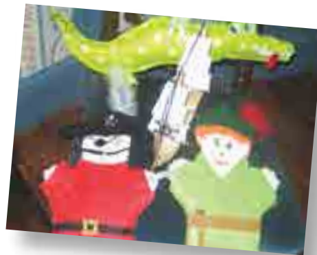
Crafts are inspired by the theme of the week. Last year the children created Peter Pan, Captain Hook, a crocodile, Tinkerbell and a pirate ship.

Information at: 313-884-7010 or info@gphistorical.org