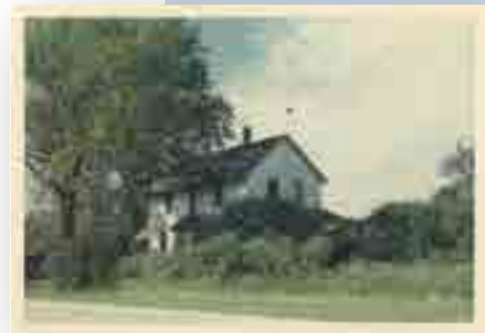
The Venderbush Farm, the site of Grosse Pointe North High School before it was built.