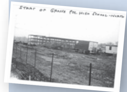
Beginning construction of Grosse Pointe North High School.