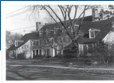
Cottage Hospital as a Nurses' Residence in 1966.

When a plaque is awarded, a member of the committee meets with the property owner and the plaque is mounted on the building. The plaque then becomes part of the property and remains with it as part of its historic legacy.